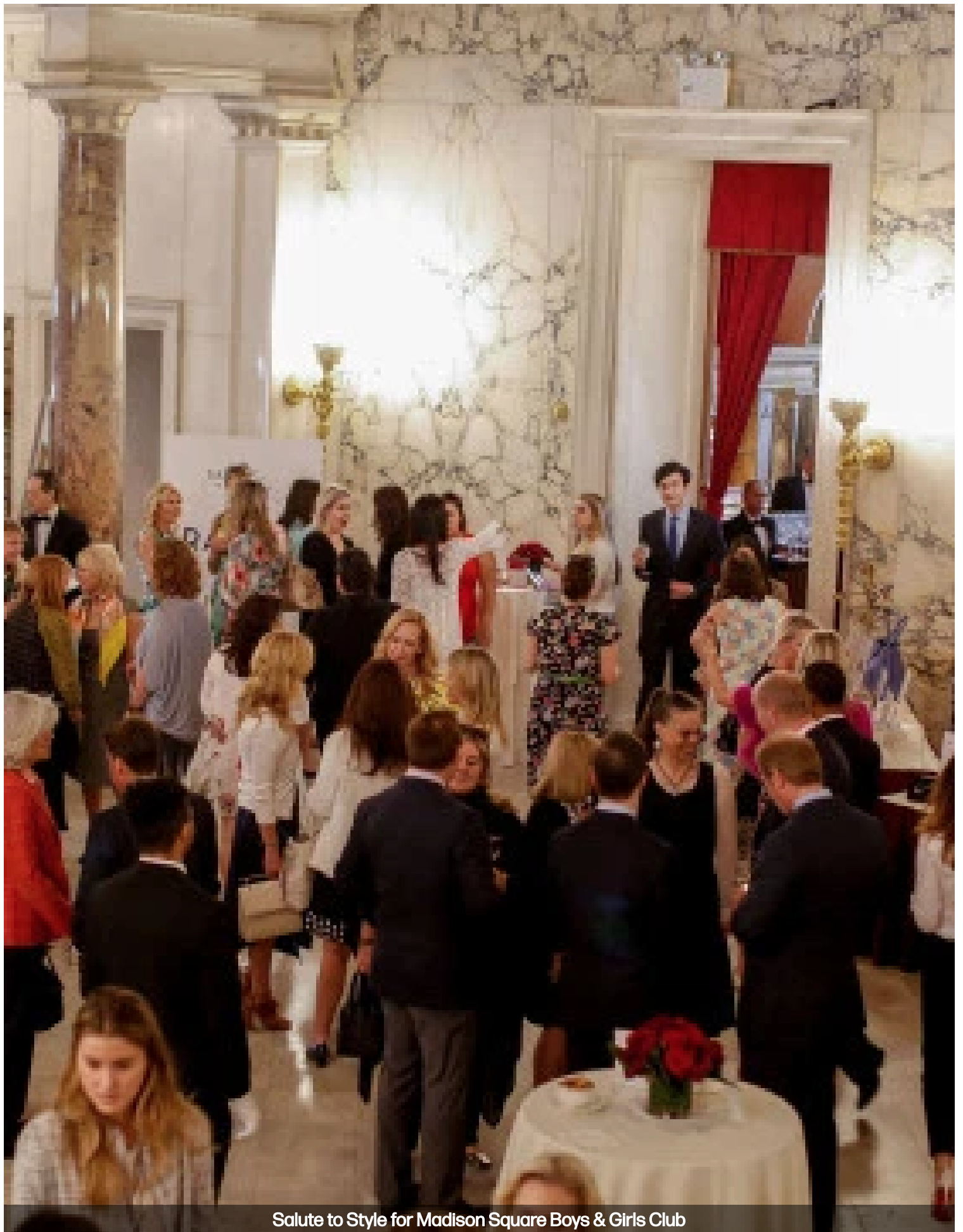
Salute to Style for Madison Square Boys & Girls Club