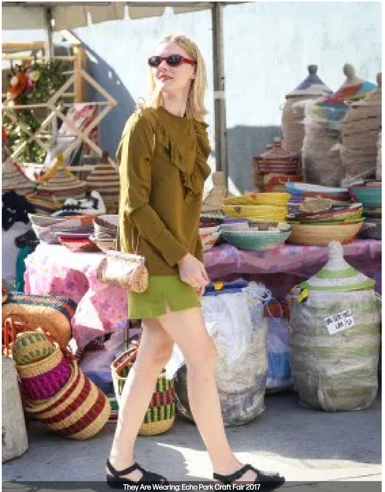
They Are Wearing: Echo Park Craft Fair 2017