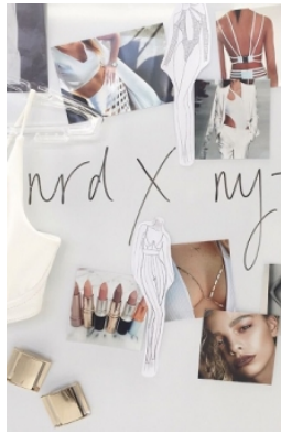
Fashion Palette SS17 Designer Inspirations