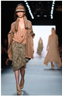
New York Fashion Week Day 1 Updates