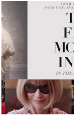
10 Best Fashion Documentaries To Watch Before NYFW 2017